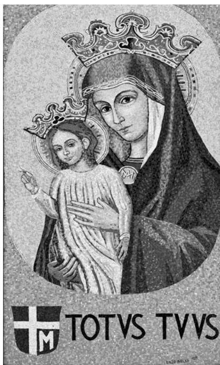
Mater Ecclesiae, St. Peter's Square, Vatican. As desired by JPPI after the attack on his life.